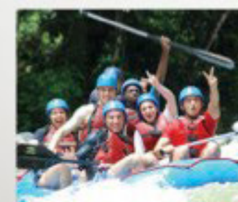
Whitewater rafting TDB