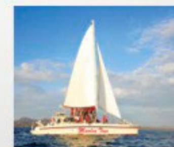
Catamaran cruise TDB