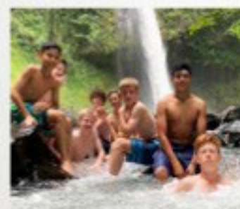
La Fortuna Waterfall INCLUDED IN COST