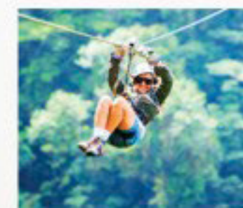
Canopy zipline tour INCLUDED IN COST