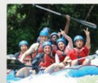
Whitewater rafting TDB