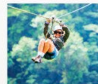
Canopy zipline tour INCLUDED IN COST