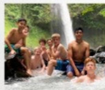
La Fortuna Waterfall INCLUDED IN COST