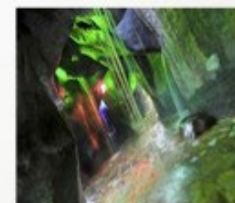
Volcanic Hot Springs INCLUDED IN COST