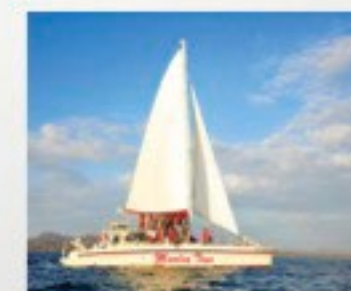
Catamaran cruise TDB