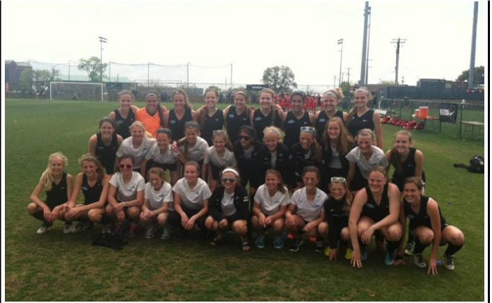
12's and 16's Post Championship

Rush Soccer: How did you feel your team's overall performance was?