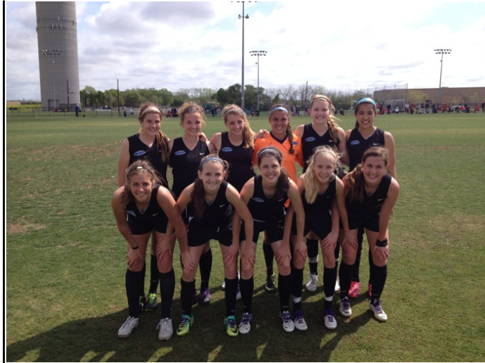
U16's First 11 in Final

Last Updated on Thursday, 18 April 2013 10:06