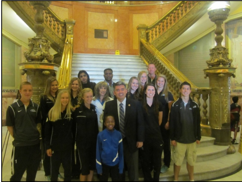
April 30th, 17 REACH ambassadors from Colorado Rush and Rush Pikes Peak gathered at the Colorado State Capitol building to be honored for all of their efforts on a recent November trip to South Africa. The ambassadors experience is detailed below.