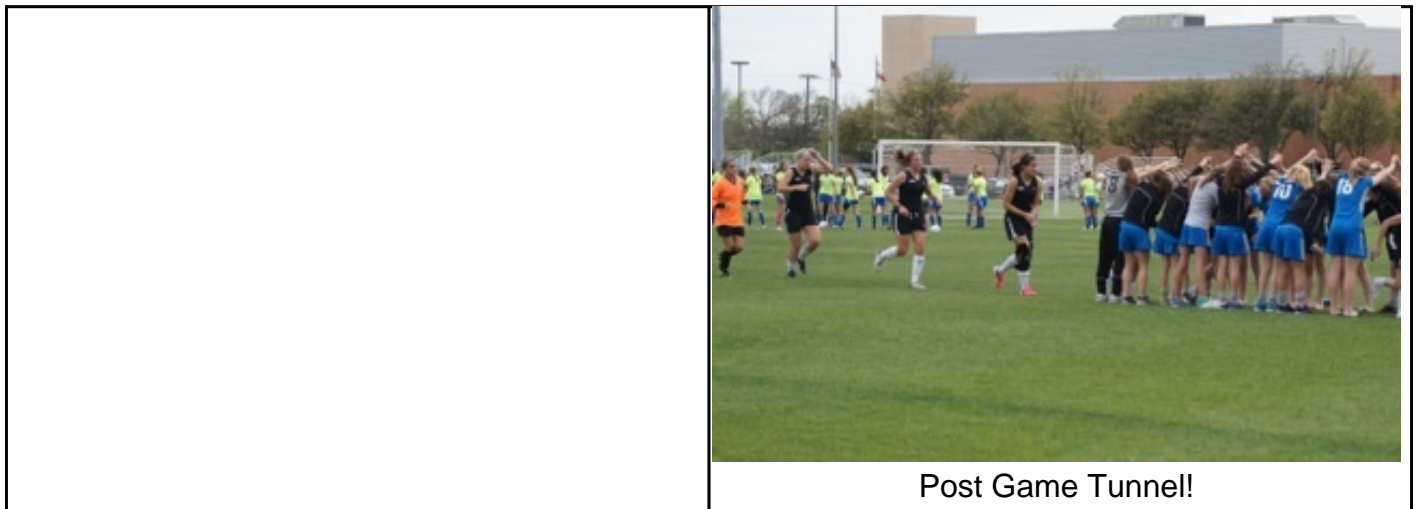
Post Game Tunnel!