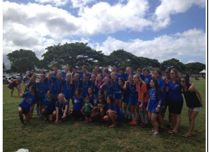
Celebrating the Semifinal win with the Rush Family